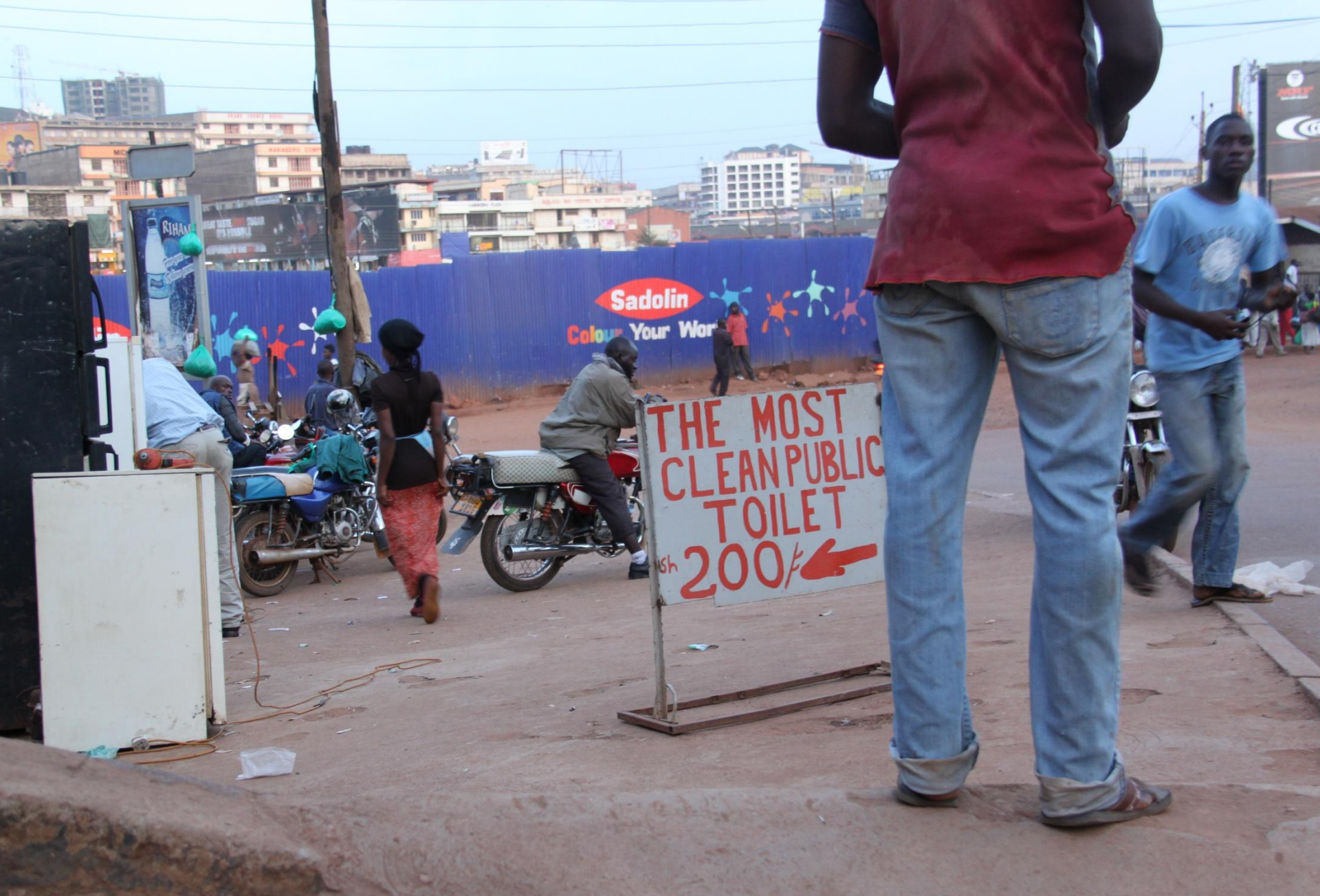
After a toilet stop in Kampala we continued westwards ...