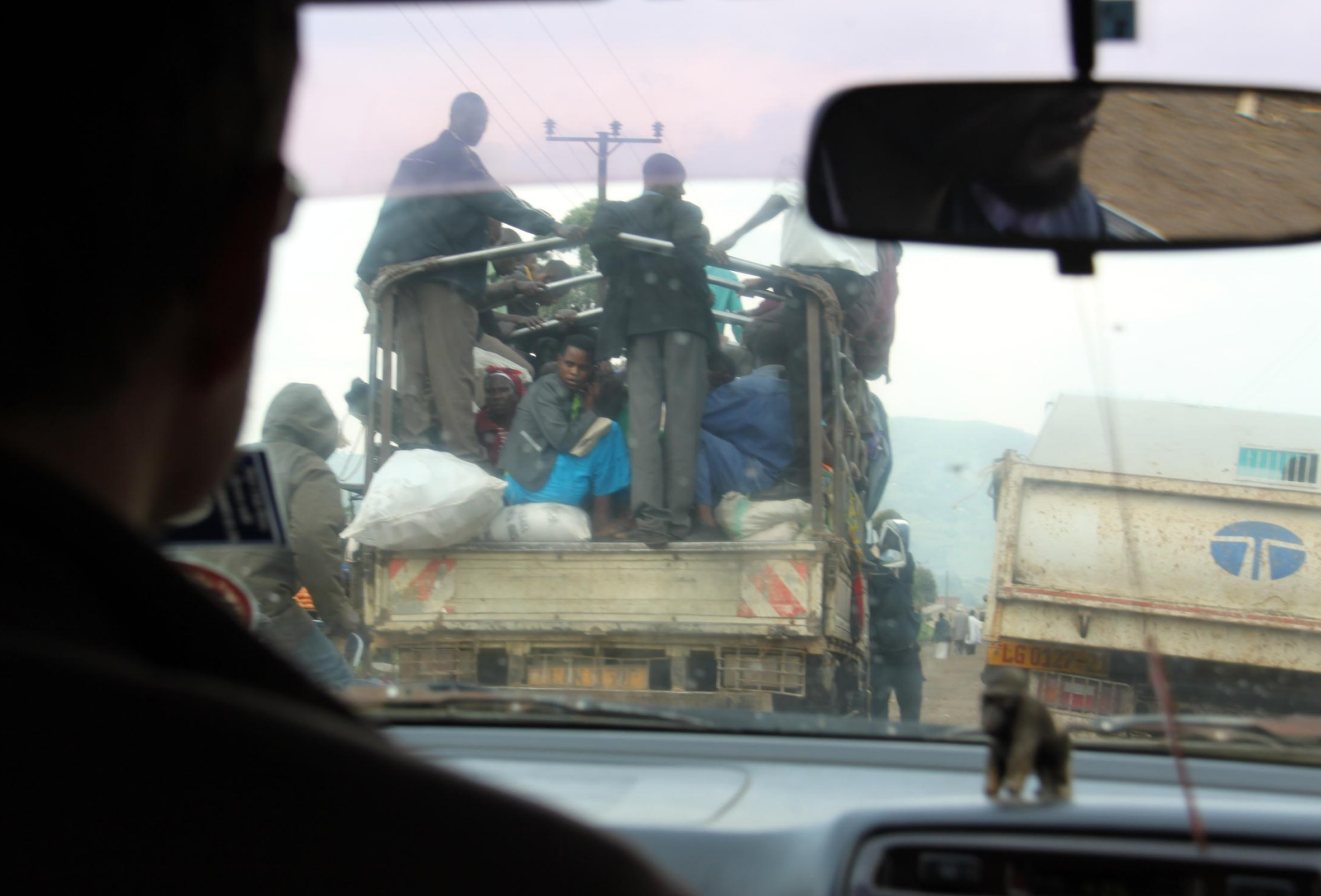
Going further south, we opted for travelling by car rather than by truck