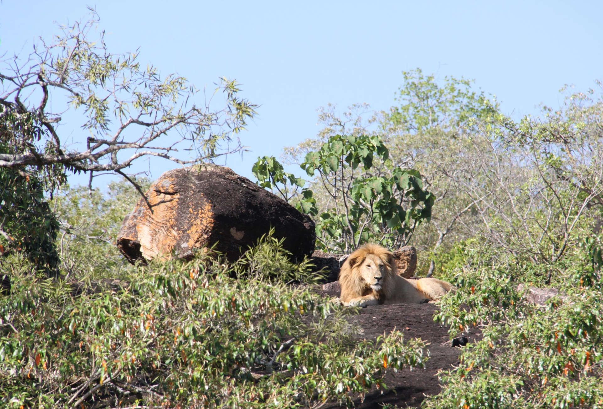
Spartacus! (that's how they call this proud male lion)