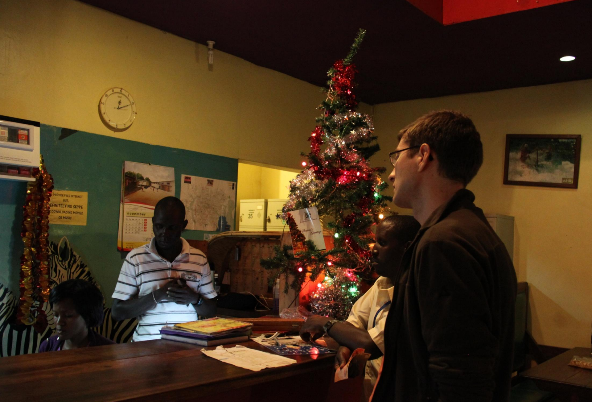
So we arrived on second Christmas day ...