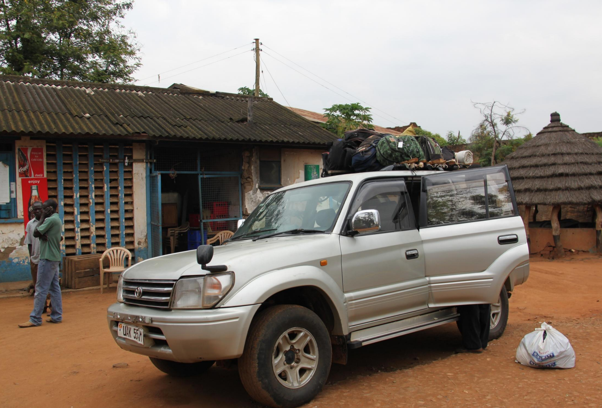
... and six vehicles ... (btw: in this one fitted 11 adults, 4 kids and one chicken)