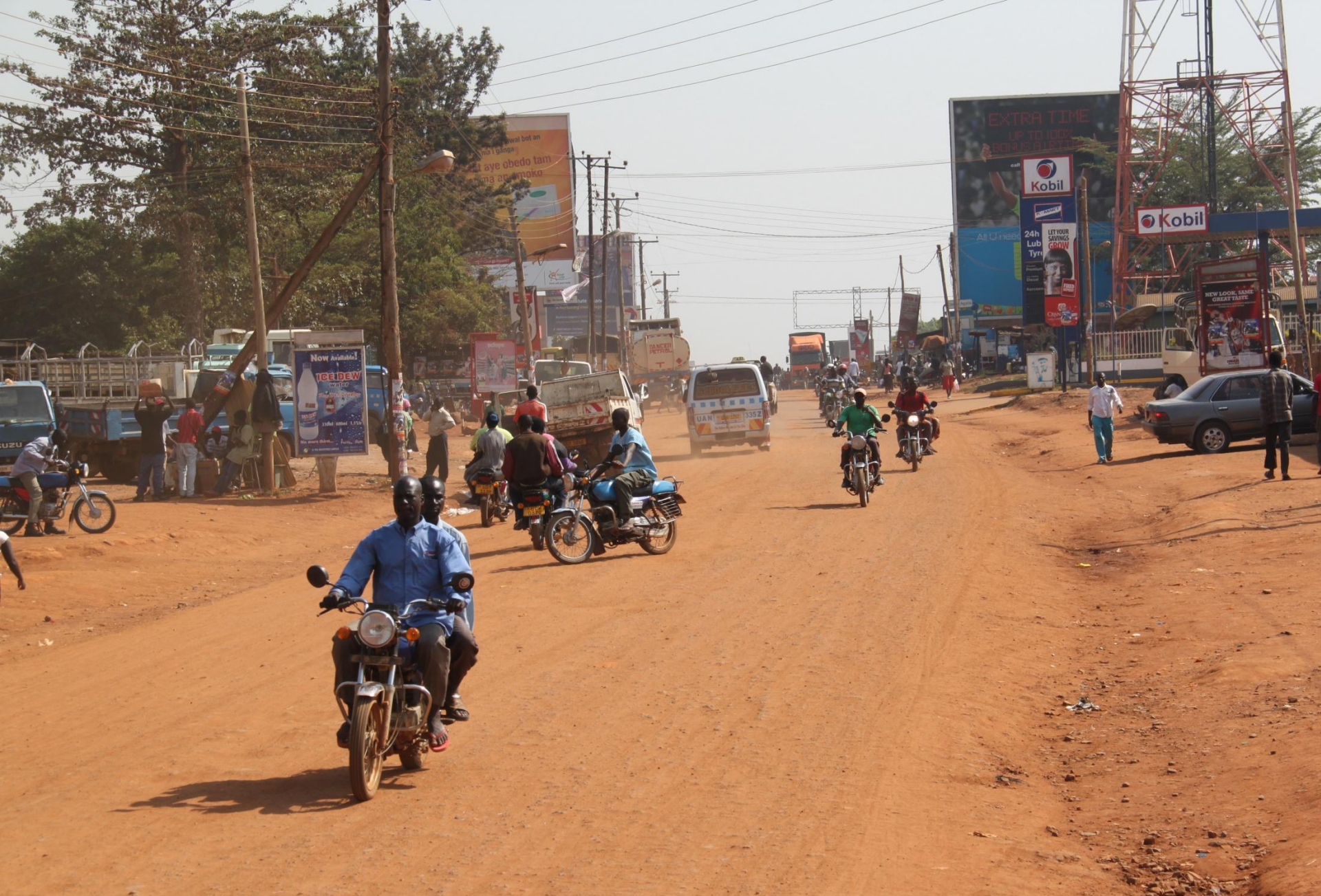
... in Kampala, Uganda's capital. Busy like hell but not much to do as a traveller.