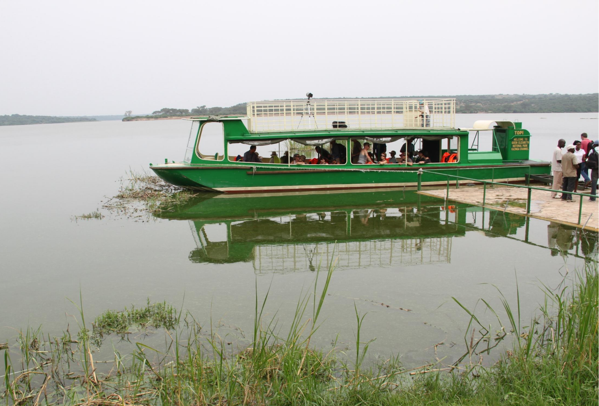
Next stop on our way was Queen Elizabeth National Park, where we went for a boat ride