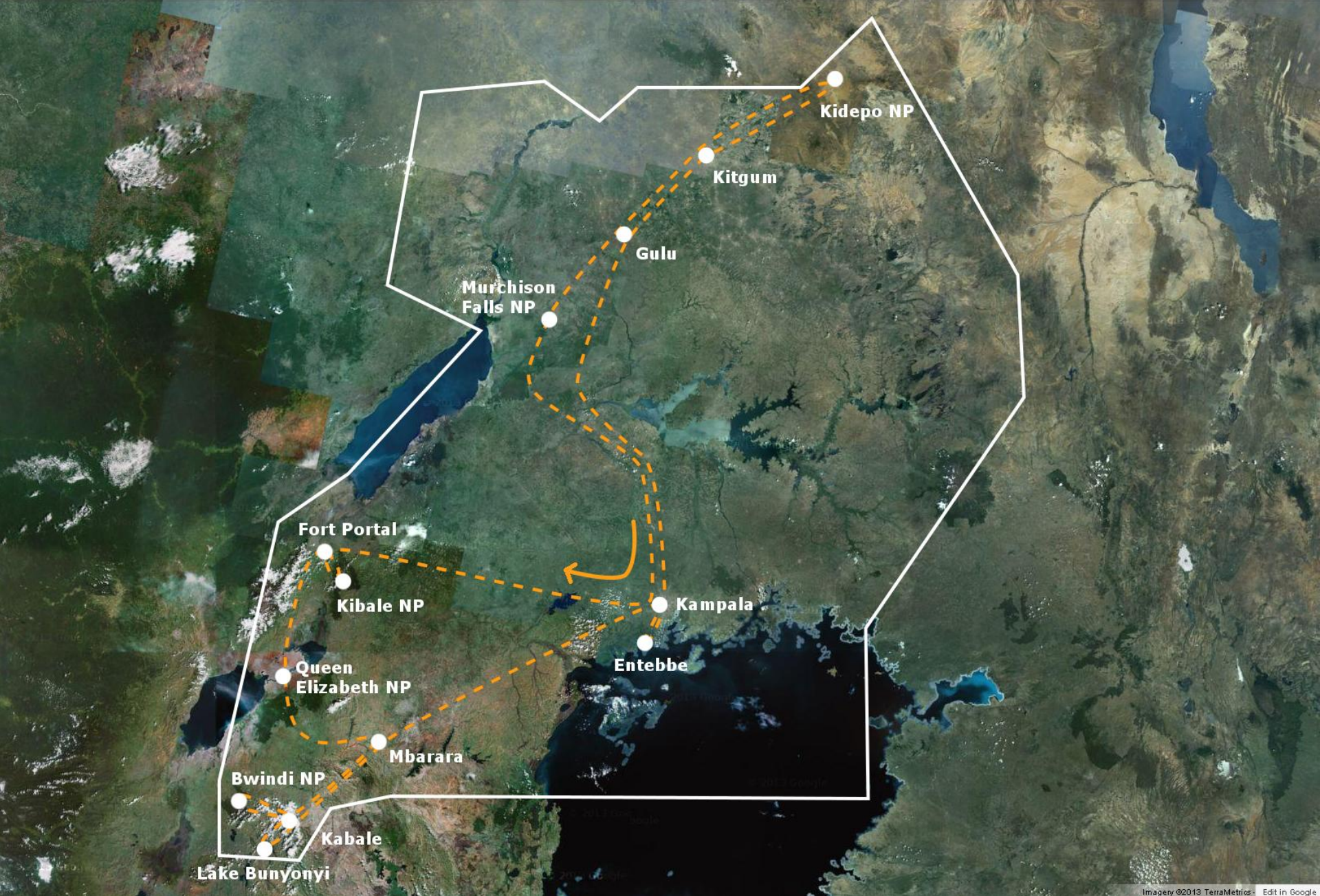
And that was our route: Starting with a northern loop and then going West